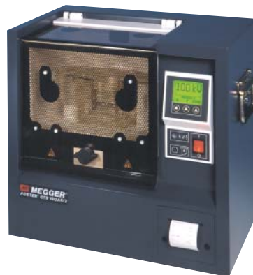
OTS60AF/2, OTS80AF/2 AND OTS100AF/2