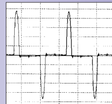
Current waveform of the inverter (primary side)