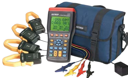
Complete with 4 current clamps, 4 voltage leads with alligator clips, 8 AA batteries, software, PC interface cable, AC Adaptor, and carrying case