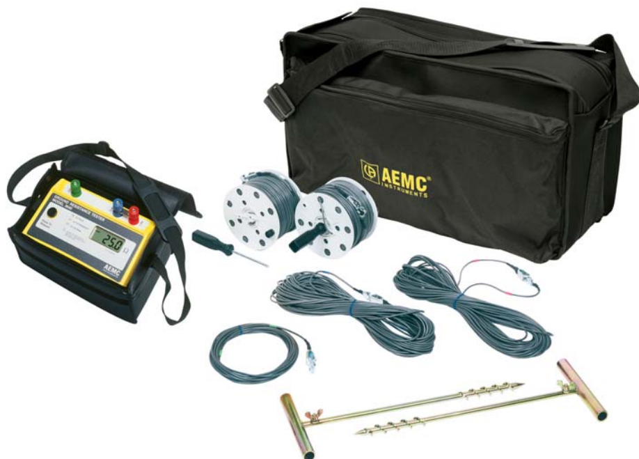
Digital Ground Resistance Tester Model 3640 Kit Catalog #2114.93