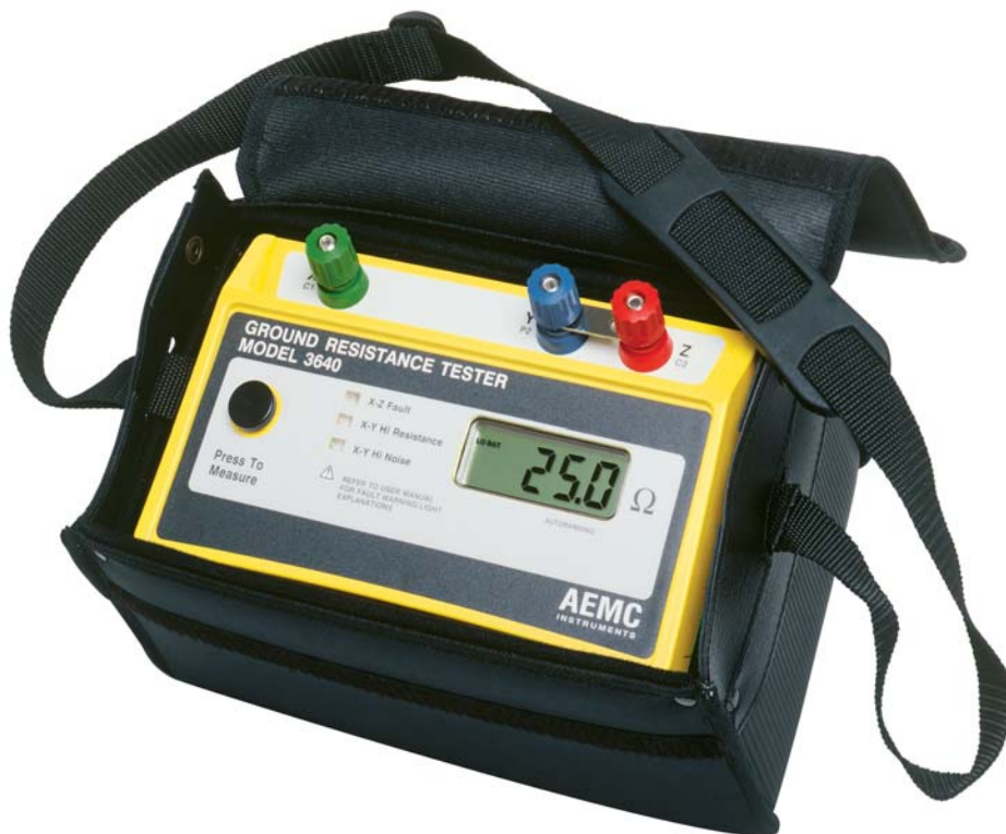
Model 3640 shown in standard soft carrying case Catalog #2114.92