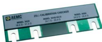
25Ω Calibration Checker Catalog #2118.58