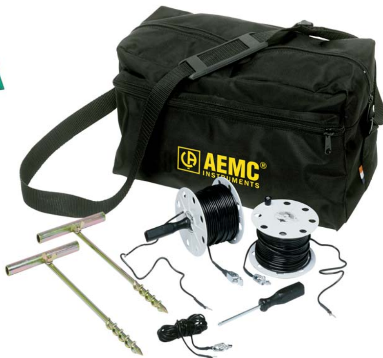
Test Kit for Model 3640 includes one 16 ft lead, two 150 ft leads on spools, two wind-up handles, two auxiliary ground electrodes and molded hard carrying case with slot for meter Catalog #2114.96